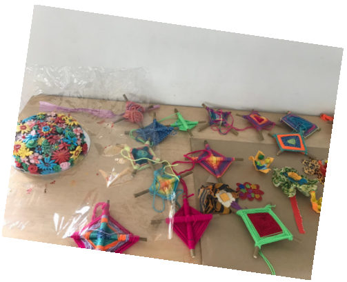
Making a God's-Eye