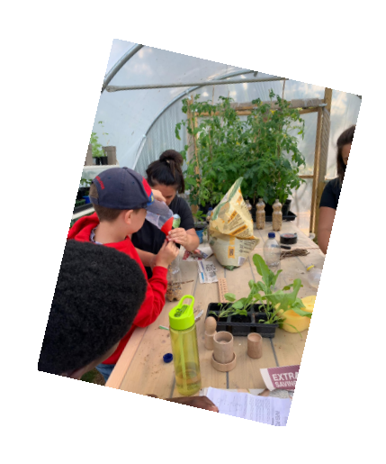
Making bird feeders