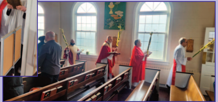
Parishioners and clergy from St. Matthew - St. Joseph joined us at St. John's for a beautiful Palm Sunday service.