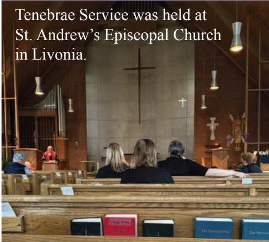
Tenebrae Service was held at St. Andrew's Episcopal Church in Livonia.