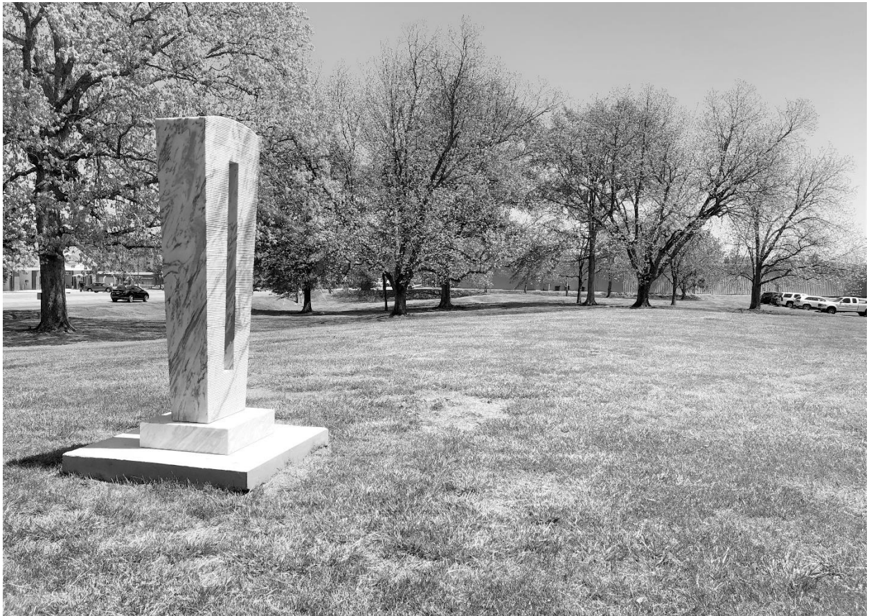
The City of Gainesville, GA Elysium 2018.

The CRLG Couture-Cut Mark is applied to finished products that are completed by our leading experts as a one-of-a-kind piece. The finished works sit between the high fashion and fine art world as architectural details, masterpieces and icons. The completed pieces are made by CRLG and CRLG Affiliated Companies in LaGrange, GA in the couture-cut custom product division with highly specialized designers, artists, sculptors, and high-quality material suppliers to complete each contracted project. There are a limited number of projects per year based on the availability of the team. Inquire for work examples info@crlg.us or give us a call +1.706.457.8008 PH.