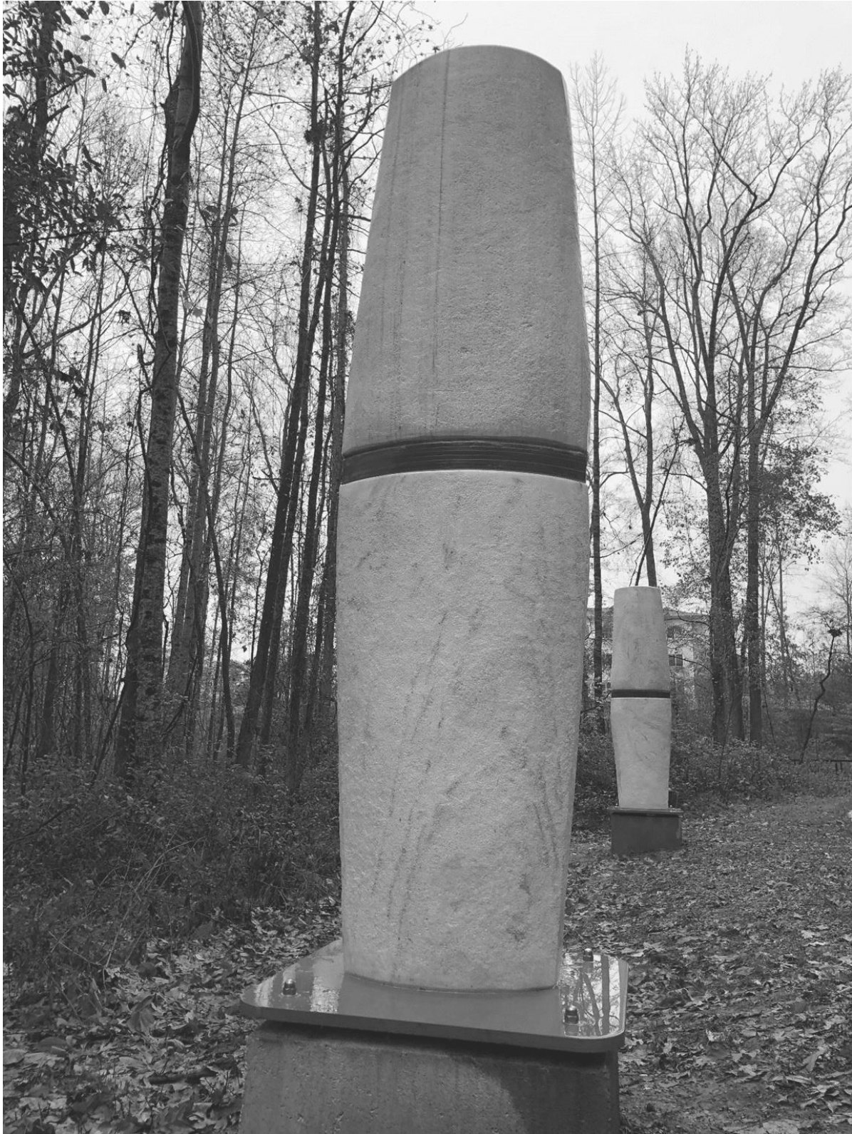
The City of Newnan, GA Concurrent Metamorphosis No. 1 2022.