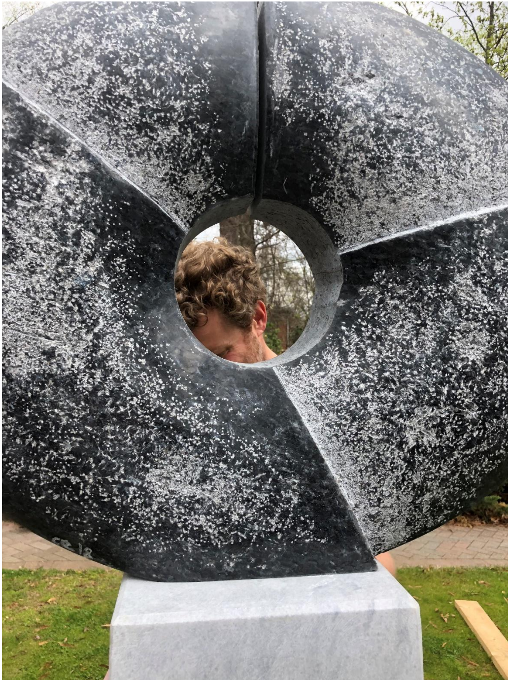
The City of Roswell, GA Granite Ring 2018.