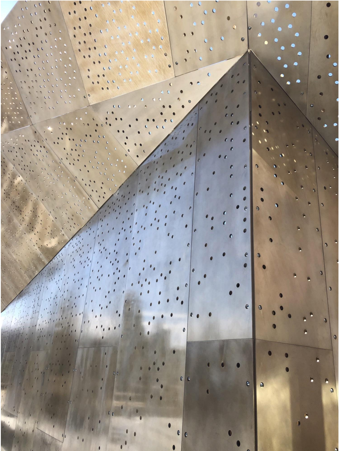
The City of Atlanta, GA Speaker Shell Microsoft Campus 2022.