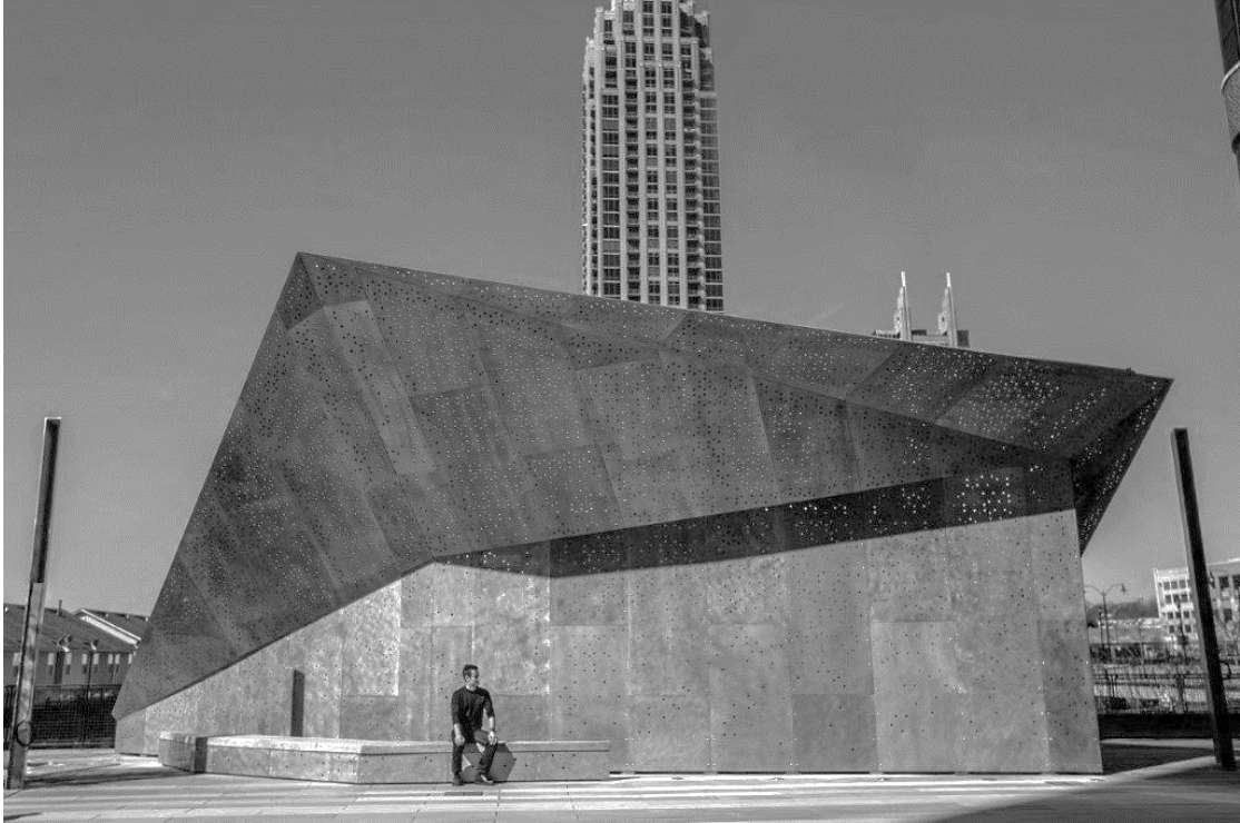
The City of Atlanta, GA Speaker Shell Microsoft Campus 2022.