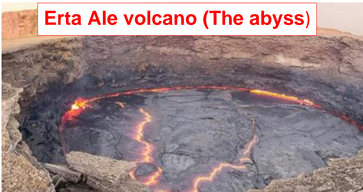
Erta Ale volcano (The abyss)

When the war is over between the Suns of Light (Afrikans) and the Brothers of Darkness (demons), all surviving Afrikans must provide their BEN and/or BAK as proof that they fought economically and/or physically against the invading demons. All those without BEN and/or BAK will be bound in chains and will be thrown into the Erta Ale Volcano in Abyssinia (Ethiopia) as stated in Enoch 90: 26 – 27 and confirmed by Enoch 27: 1 – 3 . Please note that even Revelation 21:8 states that cowards are equated with the wicked and thus shall be thrown into the lake of fire.