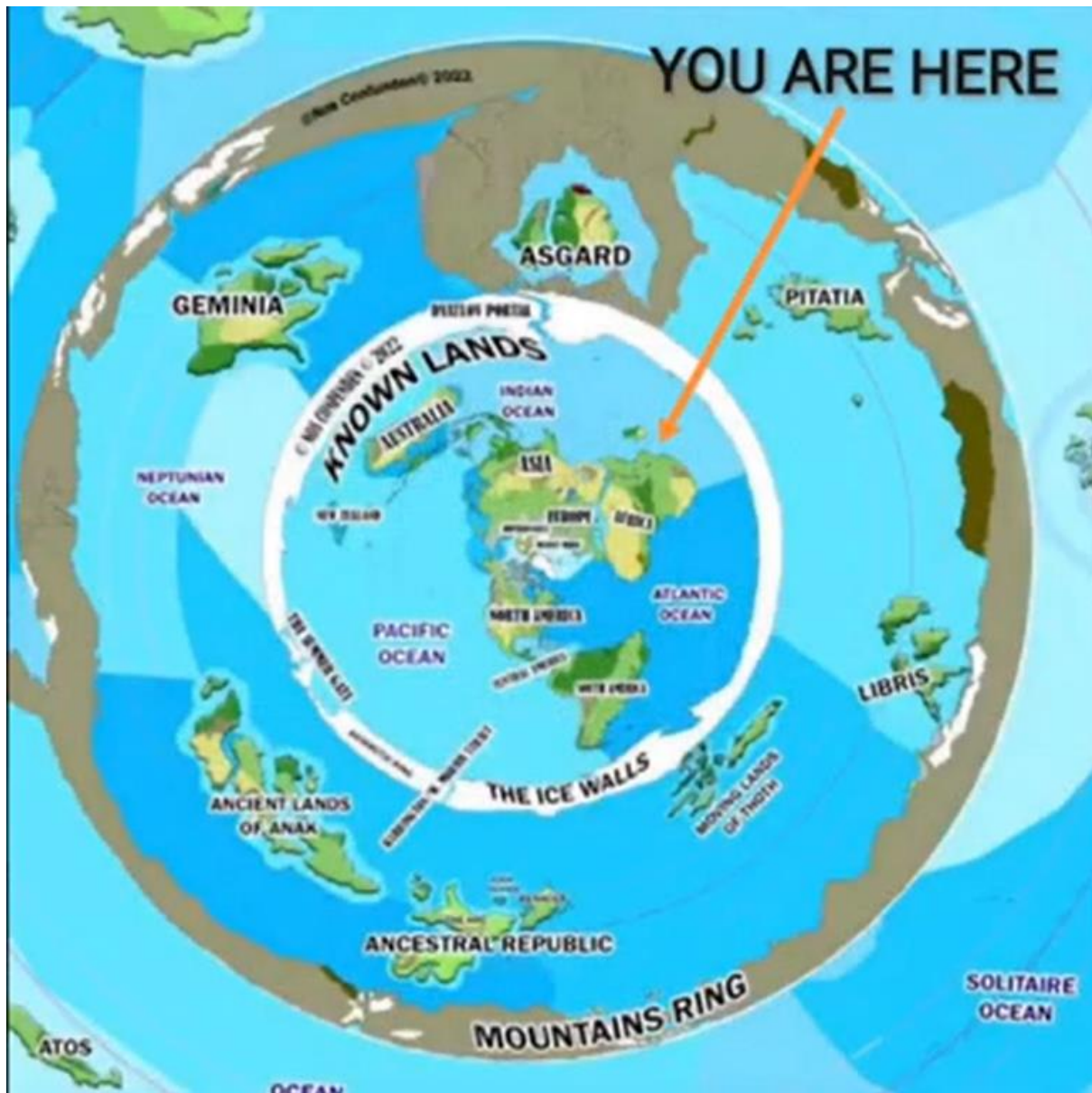
Annexure D: Map Showing Where the Ancestors are Residing