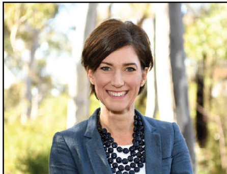
NICOLLE FLINT MP FEDERAL MEMBER FOR BOOTHBY

*CRIME TREND ALERT* Theft from Motor Vehicles REMEMBER Remove belongings from sight & REMOVE ALL VALUABLES from your vehicle *LOCK YOUR VEHICLES AT ALL TIMES*