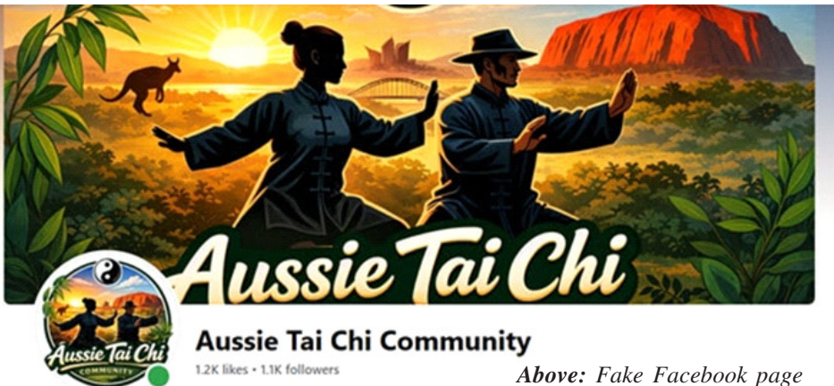
Above: Fake Facebook page

social media pages where people received a call or message after joining, telling them to download an application to register for the sessions.