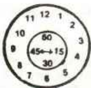
15 Seconds Early 15 Points Lost