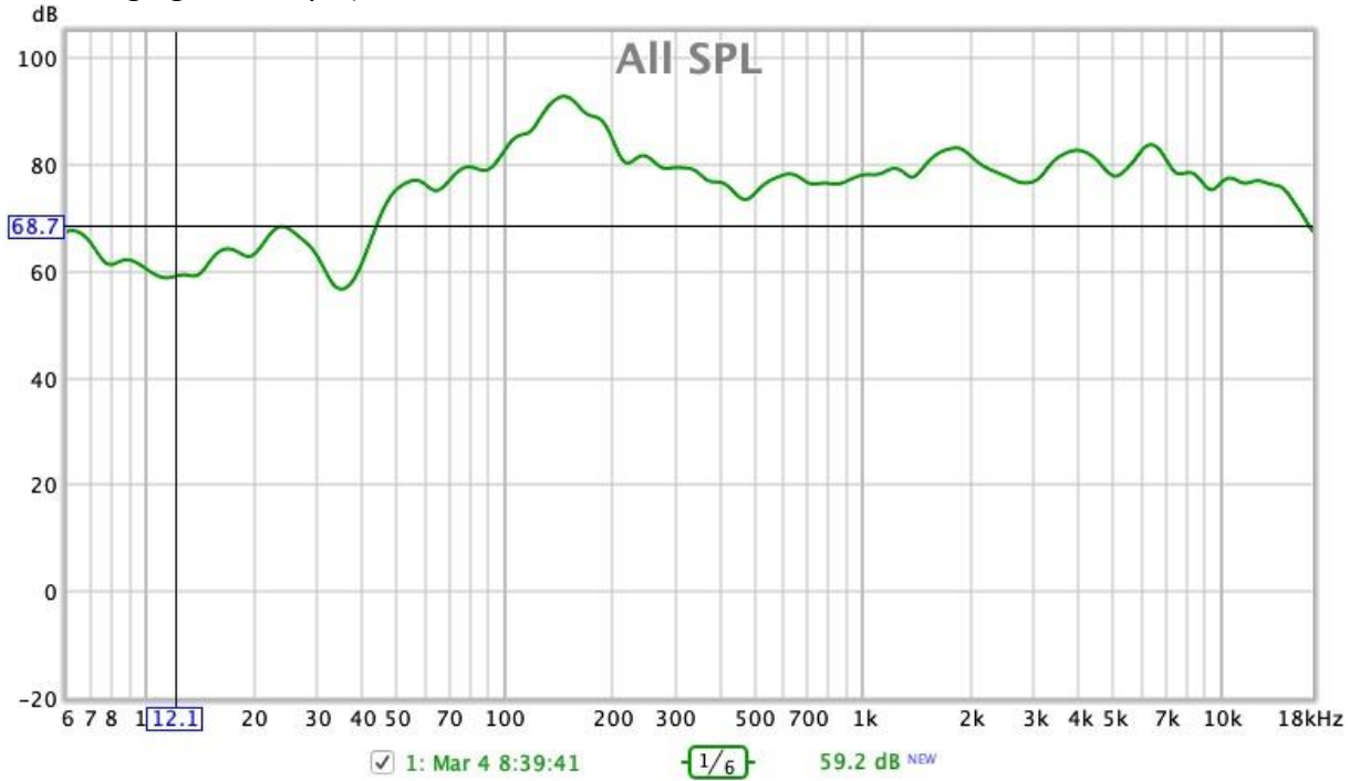
Curve 2 – Two 10ga Paralleled Runs – Jumper Installed

This test showed very slight changes in the measured room curve. While there were SLIGHT CHANGES to the measured sound there was certainly nothing significant or audible. Could have been changing humidity:-)