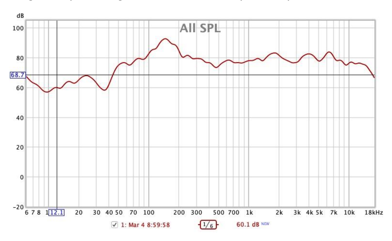
Room Curve 1 – Single 10ga Cable – Speaker Cable in place

This was my reference base... The sound to which I was familiar and have been living with for a while. While I normally listen with the Subs on, I have done listening without and this was what I was used to and expected. A smooth, full range sound with a well-defined, but somewhat lacking bottom end.