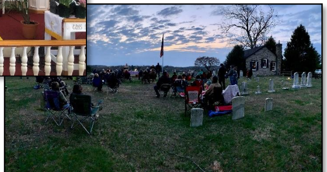
Easter Sunrise Worship