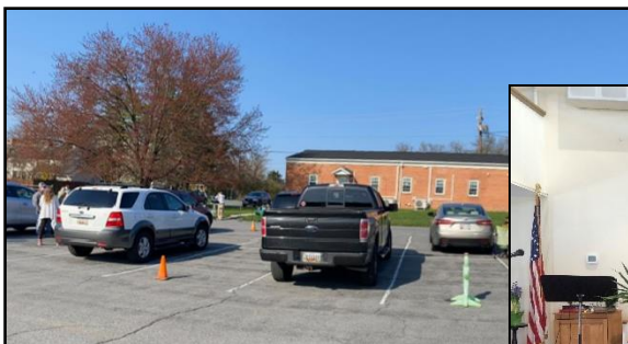
Parking Lot Worship