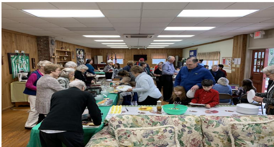
UMW raised $500 at the Souper Bowl Sunday!