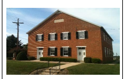
New Market UMC