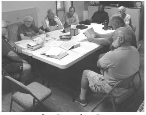
Men's Study Group

Thursdays @ 7:00 p.m. Men's Fellowship and Bible Study Weekly at New Market UMC Ed. Bldg. kitchen