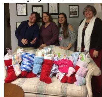
LIFT Ladies prepare stockings for Birthright

Our next meeting will be a change from our Monday night meeting. We will be hosting the Agape Feast on February 9th at the schoolhouse from 11am -1pm.