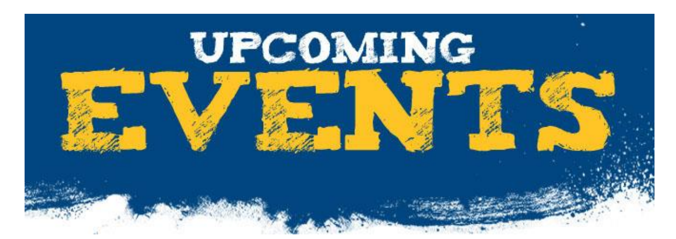
Oct, Nov & Dec - 2022

Trek or Treat – 10/22 – Church Parking Lot – 4:00 pm