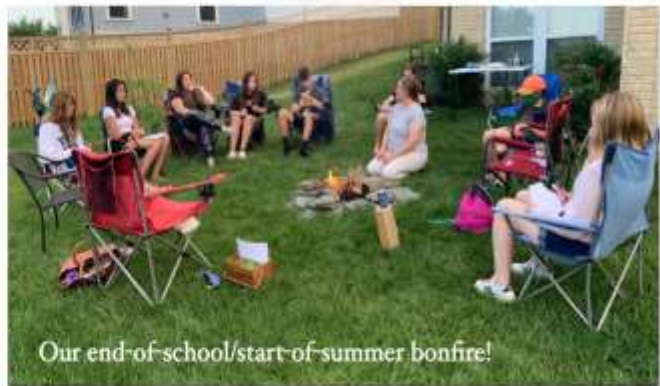
Our end-of-school/start-of-summer bonfire!