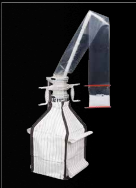
Simple sampling capability

In conjunction with a transport box made from cardboard ACUBE is appropriate for transportation from one facility to another. UN transportation certificate is available.