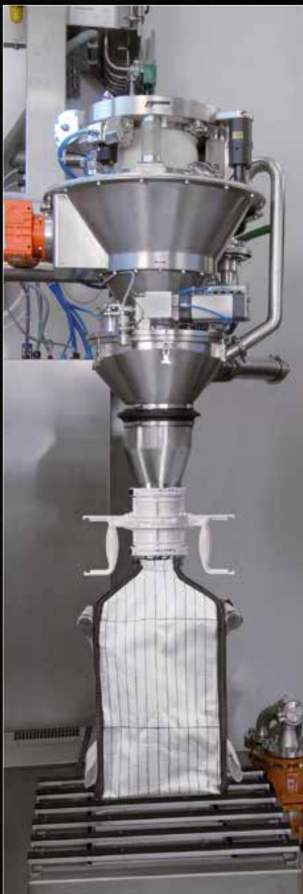
Appropriate for dosing and weighing application