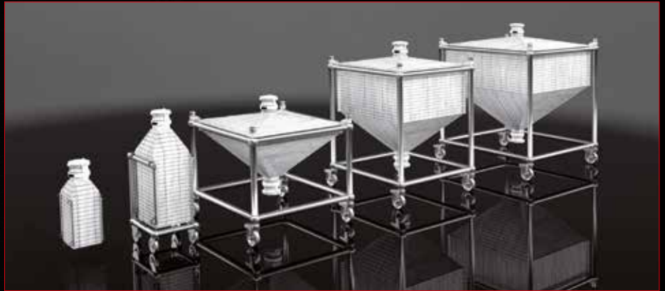
Wide range of sizes and executions to meet any application

As an option ACUBE can be delivered as an approved execution suitable for ATEX zone 1. Thanks to its cubic 3D shape complete emptying is even under non-atmospheric conditions like downstream of a tablet press (slight negative pressure) easily to realize.