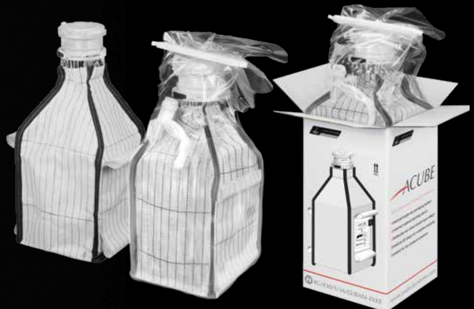
Conductive executions ATEX zone 1