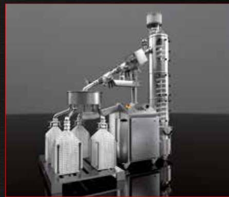
Integral containment system

Equipped with the outstanding AVAX technology it allows various material handling operations under fully contained conditions. ACUBE is available from 10L up to 400L and covers all aspects of powder, granule or tablet handling.