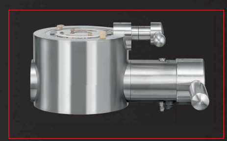
APORT interface closed