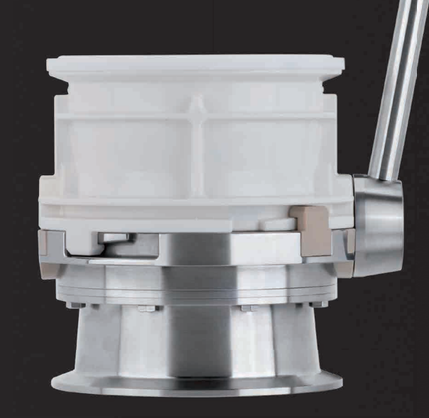
Hybrid operation Disposable passive docked with stainless steel passive

The system can be operated either manually or automated by use of a retrofitted actuated opening device.