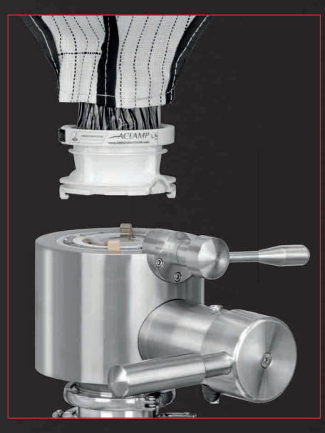
Hybrid connection or disconnection: AVAX single-use on top and APORT with integrated AVAX stainless steel

Currently, complex and difficult to clean systems are been installed for pressure, vacuum, temperature, CIP/SIP and solvent resistance applications.