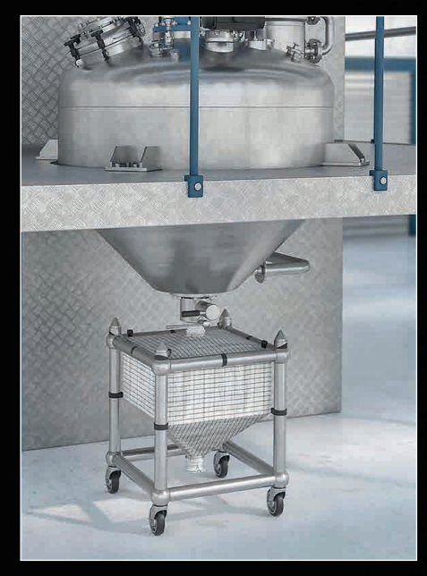
Emptying out of vacuum dryer via APORT into ACUBE packaging unit

APORT is the worldwide first and the only valve which meets all these requirements.