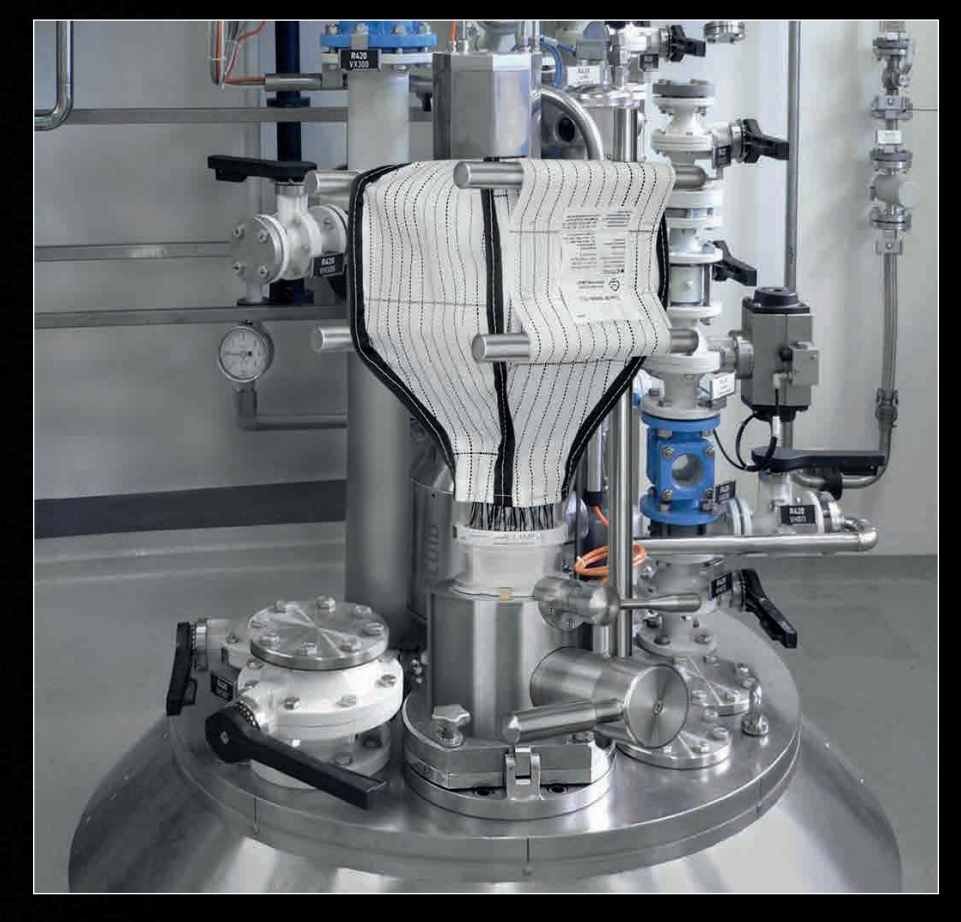
Single-use reactor charging with vacuum & pressure resistant APORT

The APORT is used in applications that include process vessels with explosive atmospheres such as reactors, blenders and dryers with high demands for containment, vacuum and pressure shock resistance.