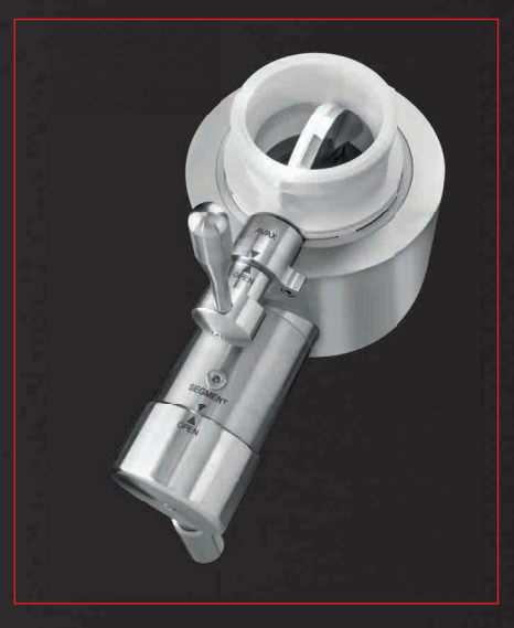
APORT locked and open