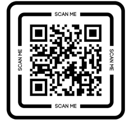
Wolf River Lutheran High School Auction

WOLF RIVER'S ANNUAL AUCTION - is on Saturday, November 15th, 2025. This year's theme is "Anchored In Christ". The cost of tickets are $45/per person or $320/table; if purchased by Oct. 31st. Prices go up Nov. 1-15th All tickets are $50/each. Feel free to check out more information on the event by scanning the QR code or on our website wrlhs.org . Thank you for your support!!