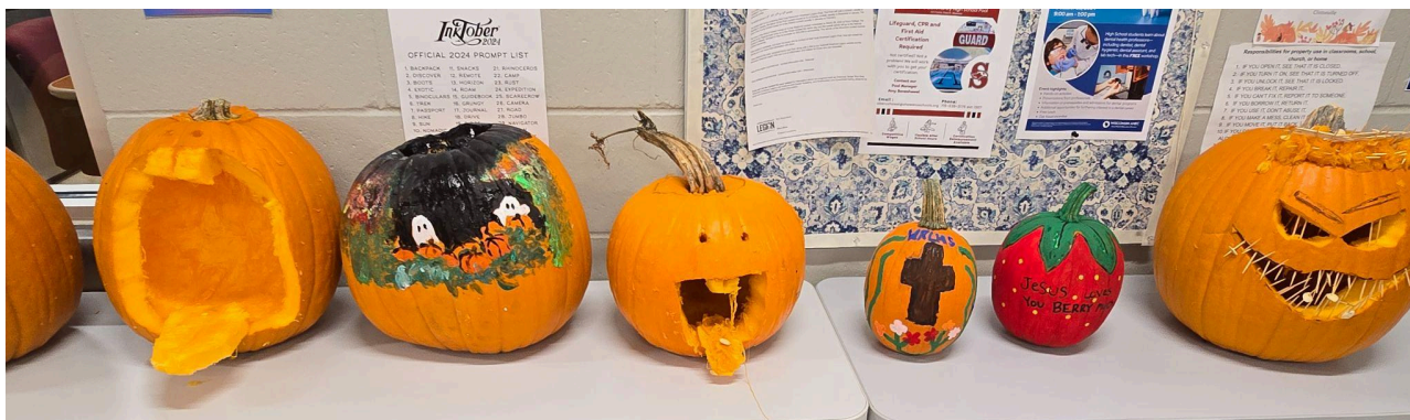
First, second and third place pumpkin carving/painting winners. Congratulations!