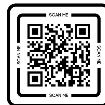
Wolf River Lutheran High School Auction

WOLF RIVER'S ANNUAL AUCTION - is on Saturday, November 15th, 2025. This year's theme is "Anchored In Christ". The cost of tickets are $45/per person or $320/table; if purchased by Oct. 31st. Prices go up Nov. 1-15th All tickets are $50/each. Feel free to check out more information on the event by scanning the QR code or on our website wrlhs.org . Thank you for your support!!