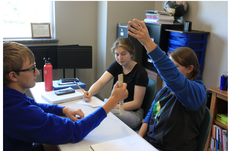
Students in Biology class are participating in hands-on learning!