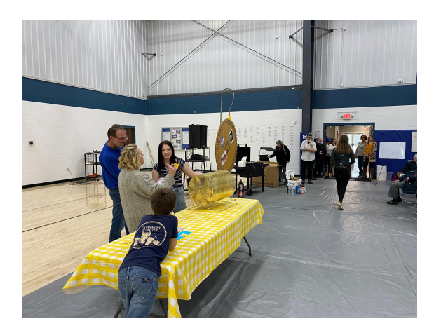
<<u>MEAT RAFFLE &</u> <u>BBQ DINNER></u> continued pictures.