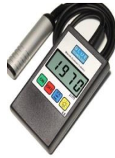
Coating Painting Tester