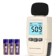
Sound Level Meter