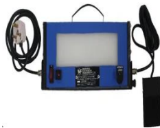
Radiography Film viewer