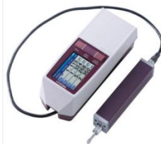
Surface Roughness Tester