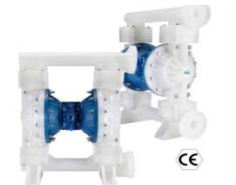
Double Diaphragm Pump (PTFE)