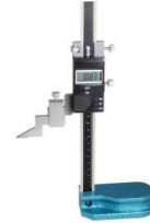
Vernier Height Guage