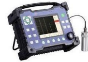
Flaw Detector Machine