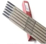
7018 Welding Rod