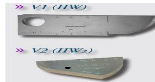
V1 & V2 Block