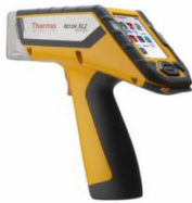
Material Analyzer (PMI)