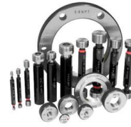
Plung & Ring Guage