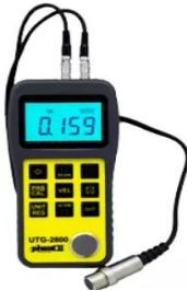
UTG Thicknes Machine