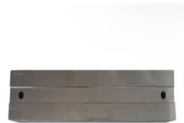
Yoke Lifting Block