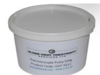
Thermo Couple Putty