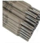
7024 Welding Rod