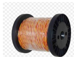
Thermo Couple Wire