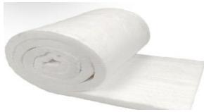
Ceramic Fiber Blanket