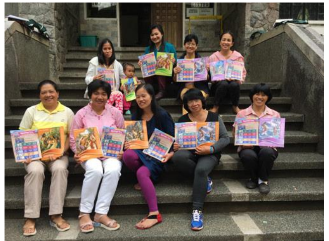
Students in Philippines with resources purchased by LWML

LCMS Deaconesses are women who are full time professional church workers, trained to share the Gospel of Jesus Christ through a ministry of works of mercy, spiritual care, and teaching the Christian faith. The LCMS Deaconess Ministry program will provide LCMS students the opportunity to become a church professional, learning and training to understand the diaconal leadership, the work of deaconesses as applied to body and soul ministry. This grant will provide educational and financial support to our partner churches who introduced deaconess training programs within their church bodies like the Philippines, Latvia, Liberia, Indonesia, Malaysia, and India.