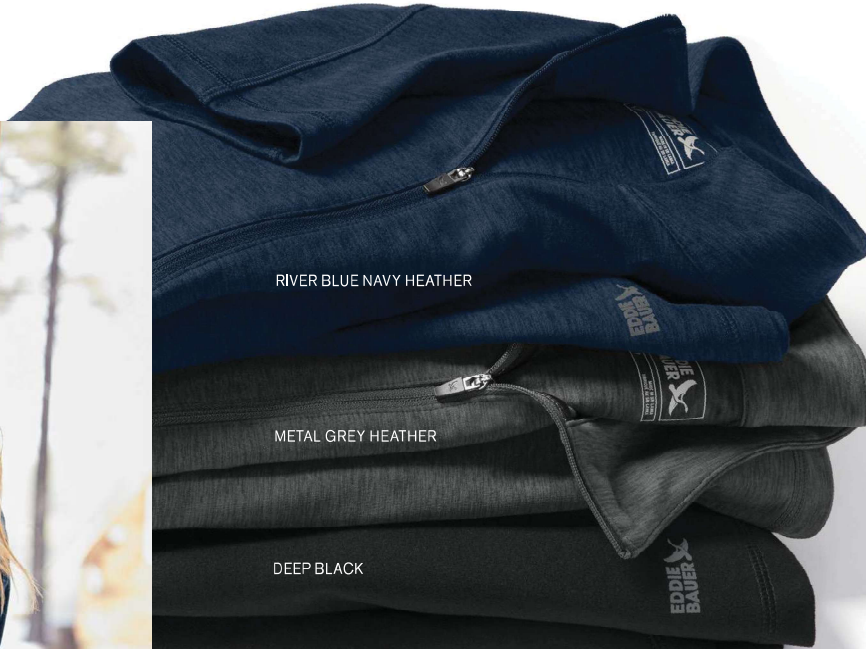
RIVER BLUE NAVY HEATHER