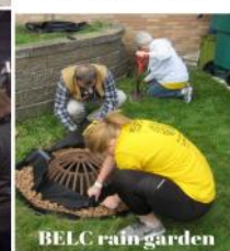
BELC rain garden