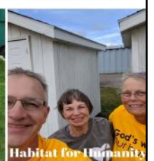
Habitat for Humanity