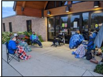
Catechism and High School Youth Group look a little different in this time of COVID! The groups now meet online via Zoom.