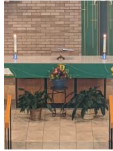
Flowers are still welcome to brighten up the altar.

Bethlehem Lutheran Church 418 8th Ave NE Brainerd, MN 56401 CHANGE SERVICE REQUESTED