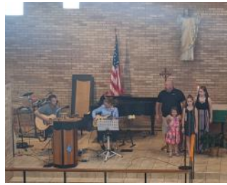
Musical offering (with social distancing between families) for a special Father's Day piece