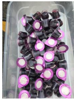
Prepacked communion kits are available on the 1st and 3rd Sundays and following Wednesdays.