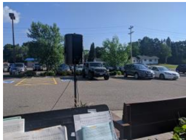
We have moved services to the upper lot.