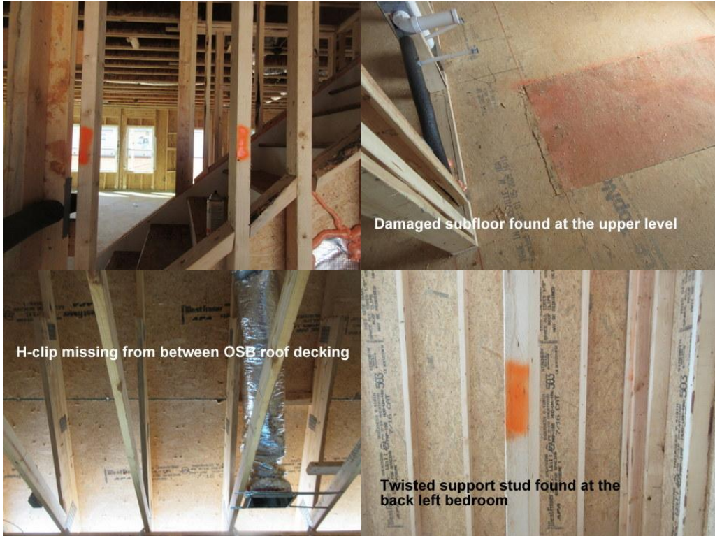
Damaged subfloor found at the upper level