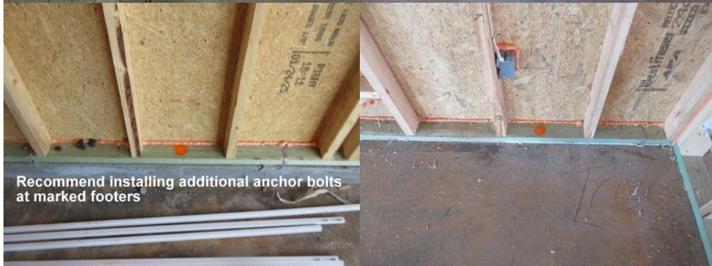
Recommend installing additional anchor bolts at marked footers