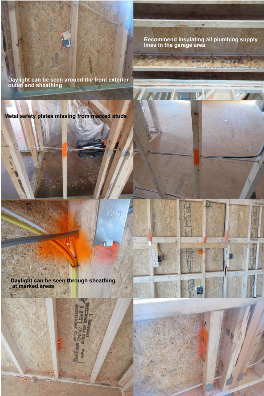
Recommend insulating all plumbing supply lines in the garage area