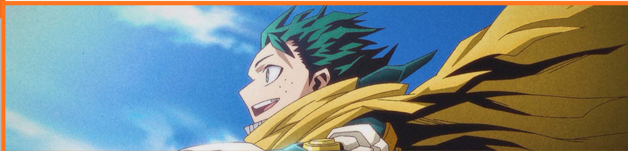
Winner of the Ultimate Crown: My Hero Academia takes home Anime of the Year.

Other Wins: The franchise also scored trophies for Best Ending Sequence ("I" by BUMP OF CHICKEN) and Best Supporting Character (Katsuki Bakugo).