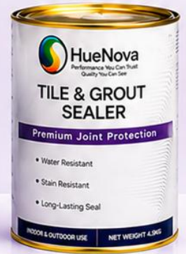
Tile & Grout Sealer