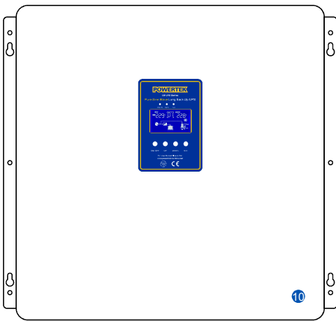
Inverter charger with inbuilt LiFePO4 battery