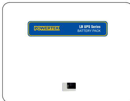
External Extra Battery Pack for more autonomy OPTIONAL