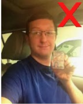
Figure 3- BAD SELFIE (Light glare)