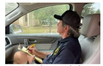
Posted Up in Vehicle