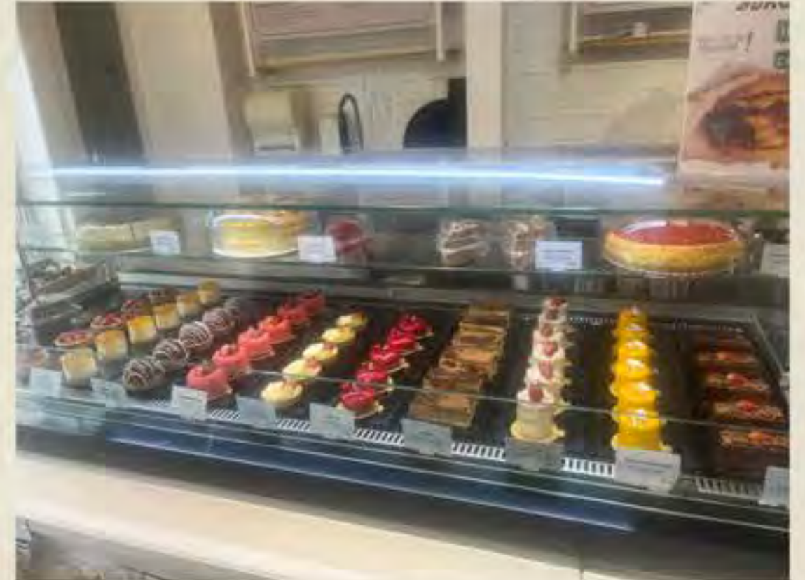
Toño's Coffee Shop