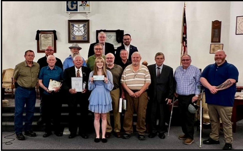
Award Recipients with Presenters