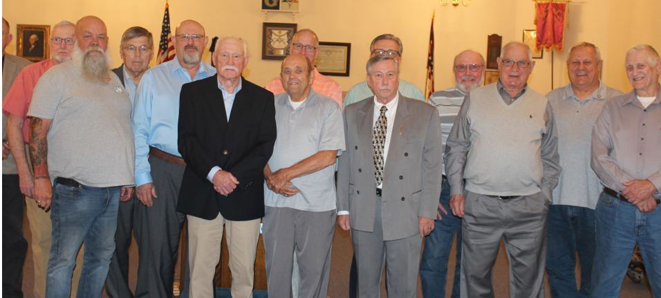
?? "The Apple Butter Gang"