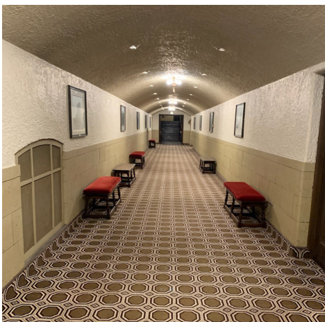
Hallway entrance to Masonic & Scottish Rite Temple, Valley of Cincinnati