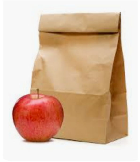
Brown Bag Company: Ongoing. With Brothers & guests. Social time at the lodge and elsewhere.