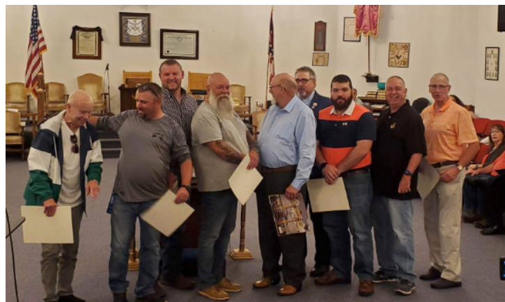
Master Masons receiving their membership certificates