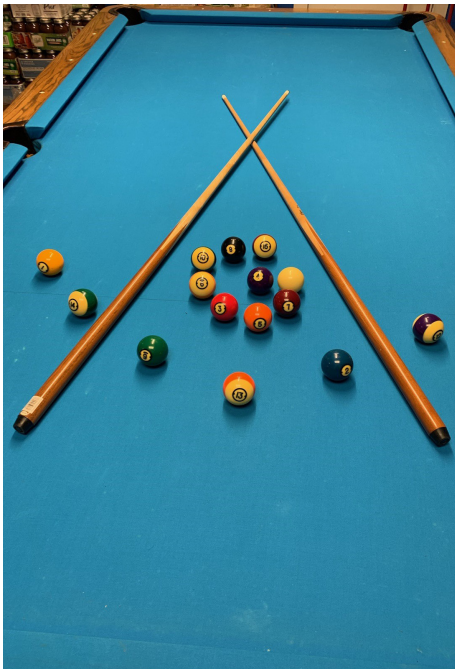
Billiards (8 Ball) Tournament Members only, starting in September