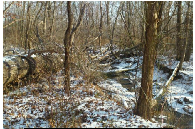
Top photo shows the large fallen oak tree while the bottom photo shows the log jams and brush.

Much thanks to the property owners that have provided permission for Amherst Township and various contractors to gain access to their property with heavy equipment and personnel. Your voluntary permission for access helps alleviate flooding issues experienced by your neighbors and on our roadways.