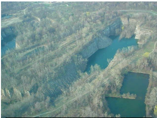
Spring 2005 view of part of the Quarry Site

The developer has not been given a green light to build! He has been given the local communities’ okay that what they have seen and heard so far is acceptable and needs to be developed further. The developer is taking the approved preliminary plan and is starting to work on specific and very detailed Engineering and Architectural drawings that will delineate the actual development and construction methods. This is also known as the “Final Plans”. During this next phase, the developer will again be constantly analyzing the financial feasibility of this project. The developer is taking the project ‘to the next level’. This will be the most exciting yet most precarious time for the success or failure of this project. Remember, one person’s scarred landscape is another person’s pristine site; and sometimes a gnarly mature tree is a symbol of Mother Nature’s beauty.