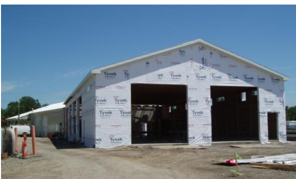
Completed Construction of Township Hall and Garage expansion as of June 12, 2009.