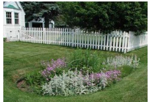
Rain garden

REMEMBER: Storm sewers do not carry stormwater to wastewater treatment plants! Storm sewers drain directly into the Beaver Creek, its streams, and ultimately Lake Erie. The chemicals washed down a driveway or the bacteria and nutrients leaking from a poorly-maintained septic system are flowing into your drinking water supply! Stormwater pollution cannot be treated in the same way as water pollution from discharge pipes, because stormwater comes from many different sources. The problem can only be solved with everyone's help.