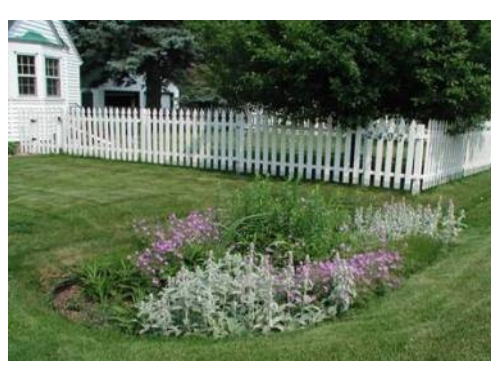
Rain garden

REMEMBER: Storm sewers do not carry stormwater to wastewater treatment plants! Storm sewers drain directly into the Beaver Creek, its streams, and ultimately Lake Erie. The chemicals washed down a driveway or the bacteria and nutrients leaking from a poorly-maintained septic system are flowing into your drinking water supply! Stormwater pollution cannot be treated in the same way as water pollution from discharge pipes, because stormwater comes from many different sources. The problem can only be solved with everyone's help.