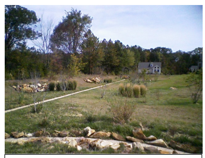
"Rain Garden" example in Amherst Township at the "Copper Creek" development by R.J. Perritt Homes

Consider rain barrels and rain gardens: rain barrels retain storm water and provide free water for use around the home and yard. Rain gardens detain storm water, enhance the beauty of towns and yards, and provide important habitat for birds and butterflies.