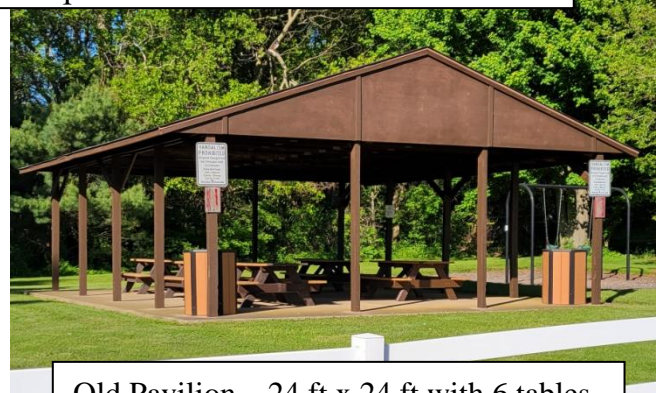
Old Pavilion – 24 ft x 24 ft with 6 tables