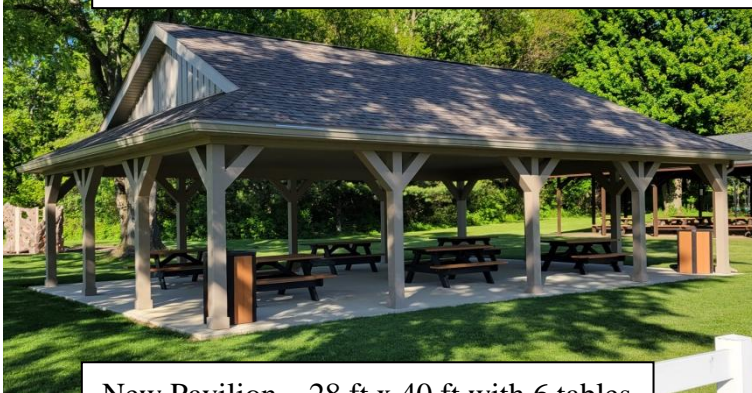
New Pavilion – 28 ft x 40 ft with 6 tables

Current reservations can be viewed on the Township's website under "DEPTS > Park