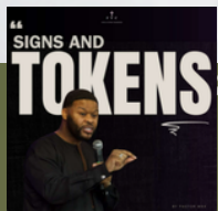
Signs and Tokens