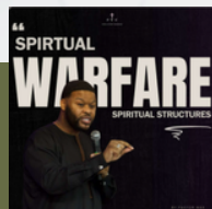
Spiritual Warfare Series