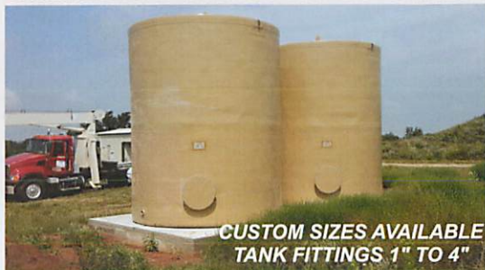
CUSTOM SIZES AVAILABLE TANK FITTINGS 1" TO 4"

Includes: Top, Manway, Vent, 1 Inlet and 1 Outlet fitting Standard Potable Water Tanks