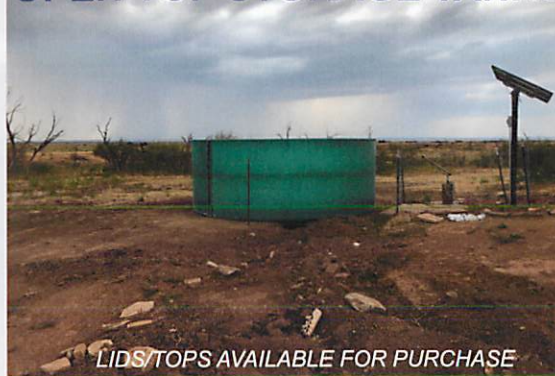
LIDS/TOPS AVAILABLE FOR PURCHASE