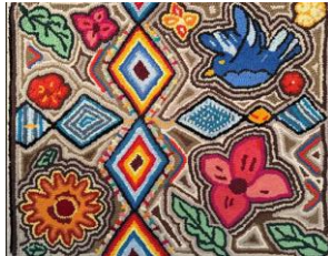
My completed rug

Informative talks were presented to the Alice Beatty and Spring Lake chapters of ATHA in an effort to raise awareness of the difficult lives some of those women lead while making economic progress in their communities for their families.