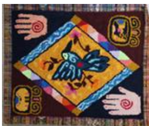
My completed rug