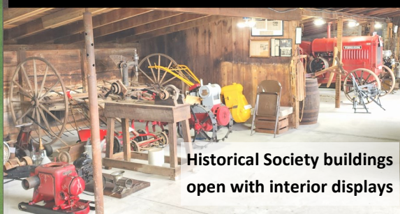
Historical Society buildings open with interior displays

Kids Activities - Tractor Games - Food & Drinks Equipment Demonstrations - Pedal Tractor Pulls Join us at a New Location for our featured shows!