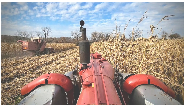
2023 Harvest! Our Clubs f20 Corn Picker and 715 Combine!

Printing of the Newsletter donated by Earl Wenz Monuments